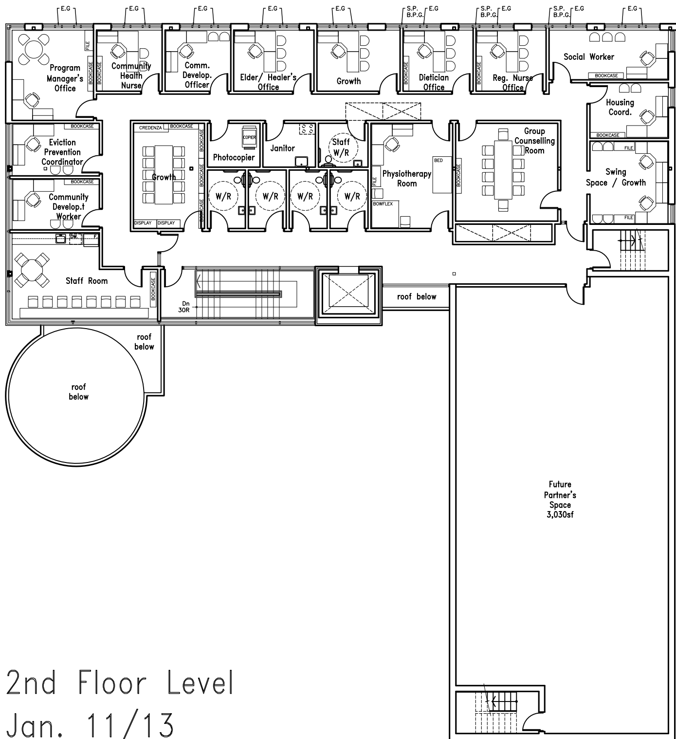
2nd Floor Level Jan. 11/13